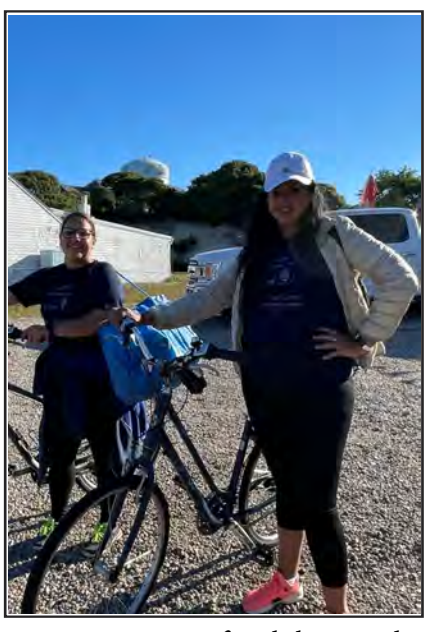
Every team gets free bike rental at the Bike Shack