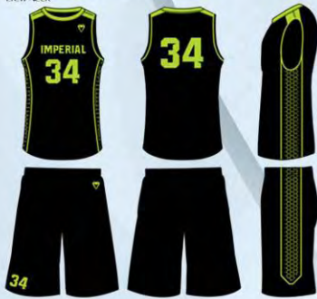
COMBINE MENS SLEEVELESS FLAG FOOTBALL Crew Neck

"The product line is going to revolutionize the sports apparel market," states Thorpe. For more information, visit the company's website at http://www.tphsports.com .